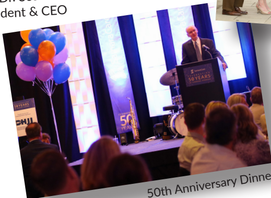
50th Anniversary Dinner