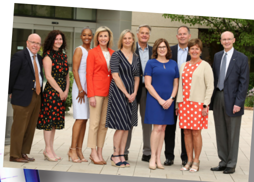
Board of Directors